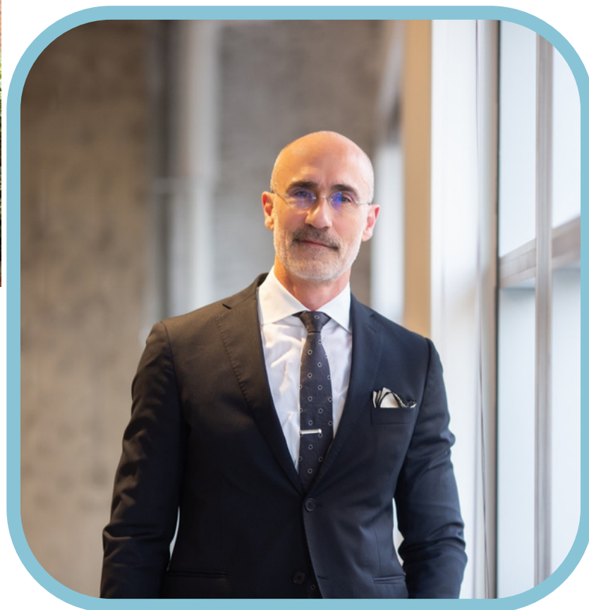
Arthur C. Brooks